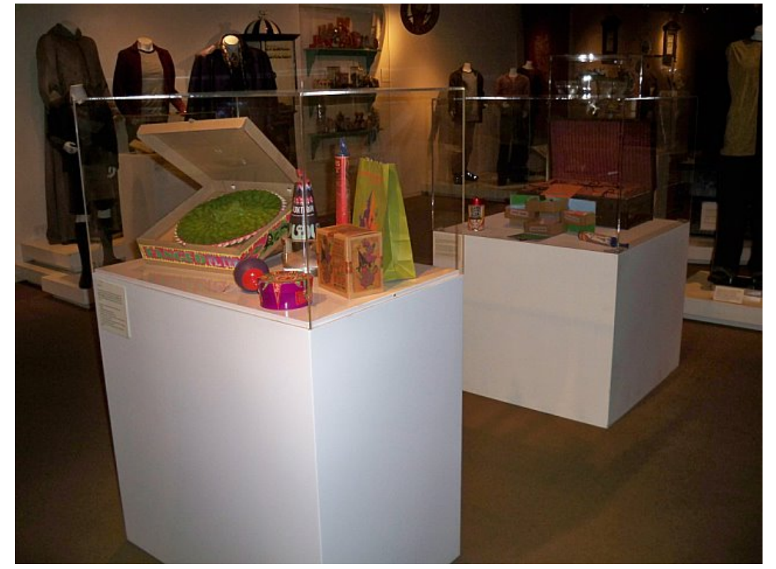
Warner Bros. Museum, Burbank, CA