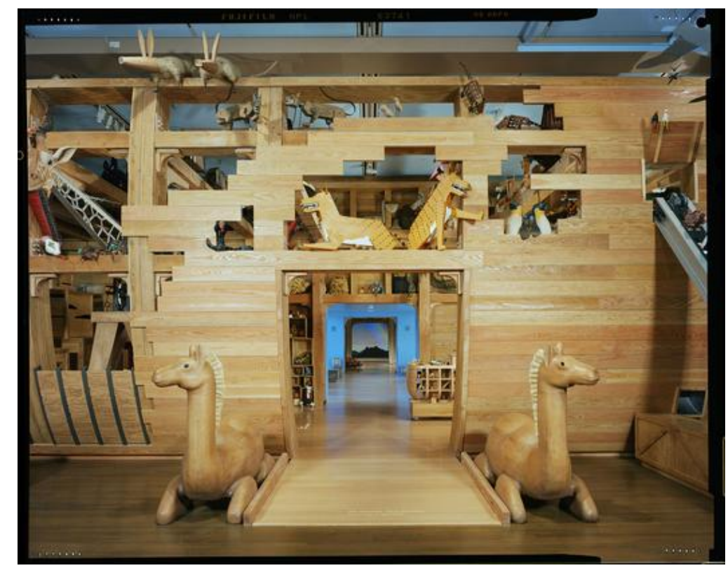
Noah's Ark exhibition, Los Angeles, CA